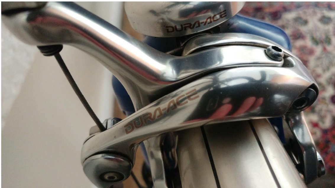
Older Style Of Shimano Dual Pivot Brake With Uneven Arm Length