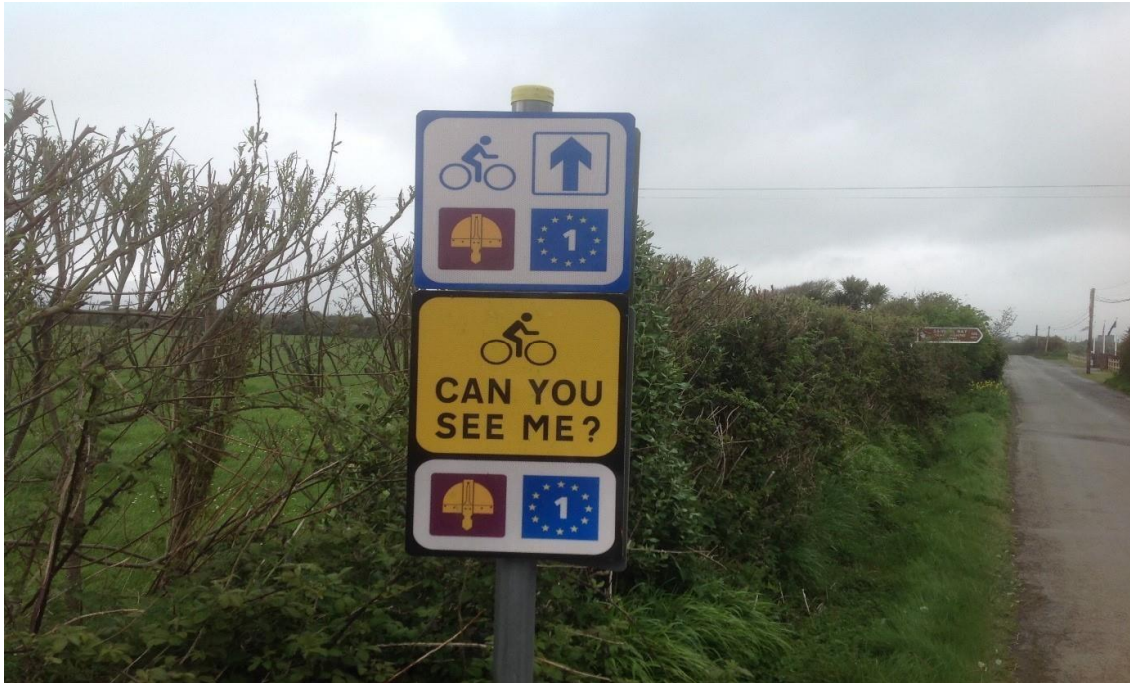
Irish Cycle Awareness Sign

Many of the features described above featured for the first time on the Shimano Dura Ace groupset, introduced 3 years ago. These ideas trickled down to Ultegra 8000 that has been around for 18 months. A final bit of good news is the new Shimano 105 7000 set of components that became available 9 months ago share most of the Dura Ace and Ultegra updates but 105 is quite a bit cheaper. Extra weight is the only down side, function is pretty much identical. C.W