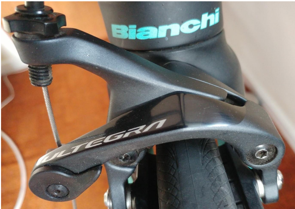
New Design Shimano SLR EV Dual Pivot Brakes