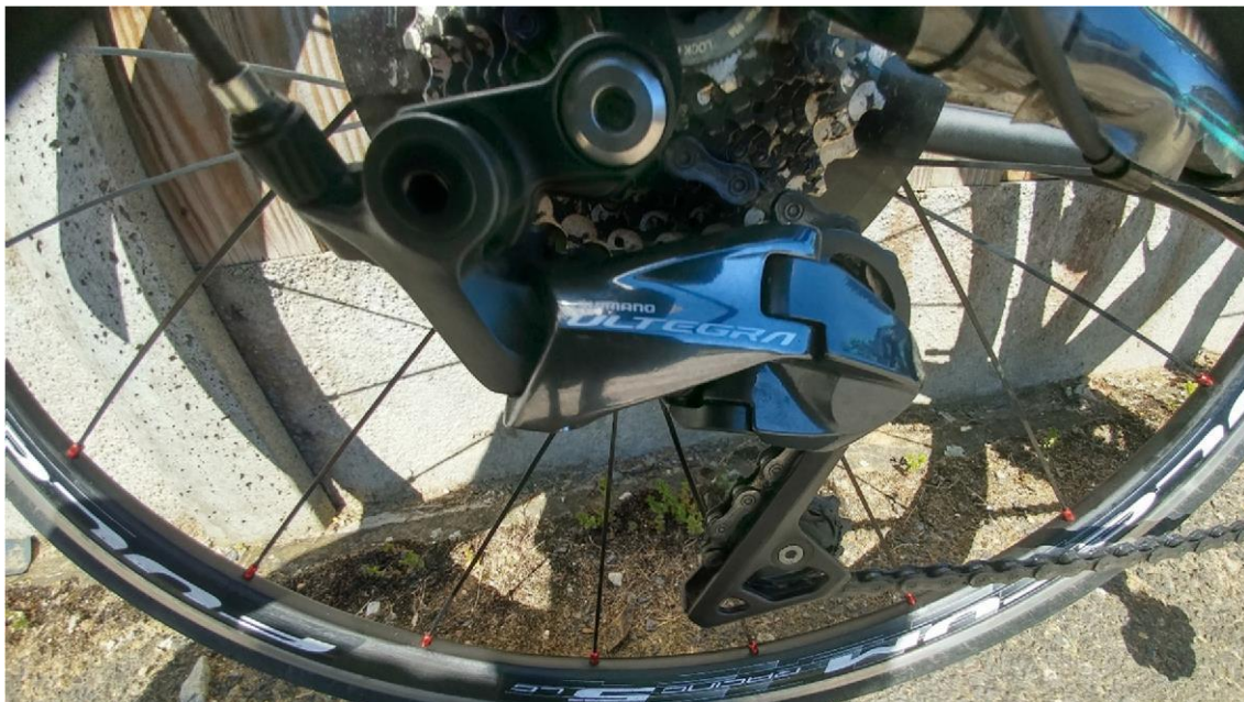
New Ultegra 8000 Rear Derailleur