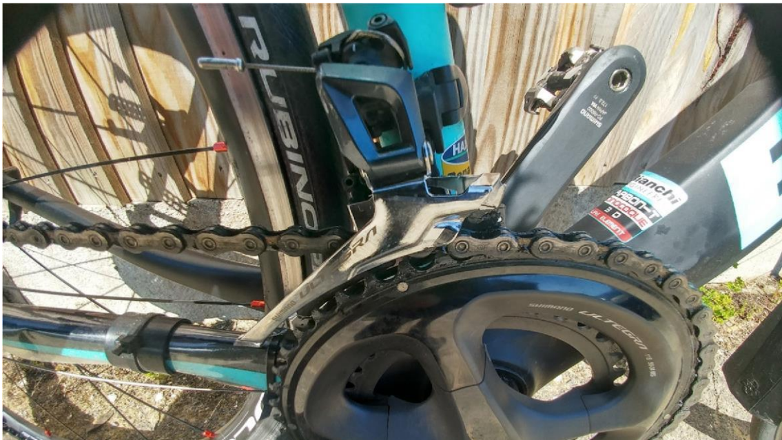
Shimano Ultegra 8000 Series Front Derailleur With Tension Adjuster

*Groupset: a family of transmission and braking components with matching styling and finish all designed to have the same price versus performance ratio.