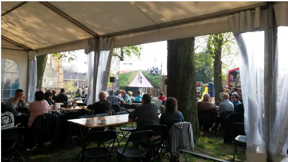
Refreshment Facilities On Ronde Van Vlanderen